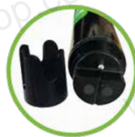
Graphite EC probe with ATC